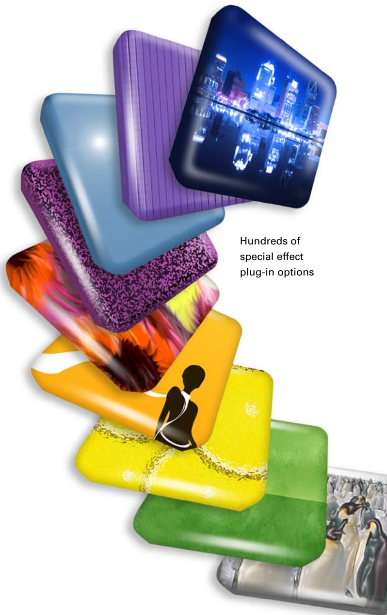
Hundreds of special effect plug-in options