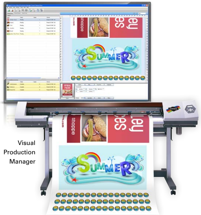
Visual Production Manager